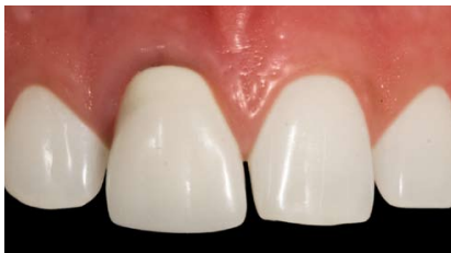
Violation of the biological width