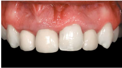
Asymmetrical dental arcade